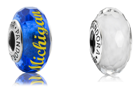
Fascinating Glass Charm